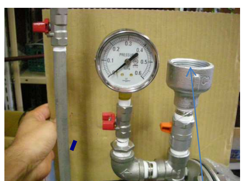
Primal pressure gauge Input adjustment valve