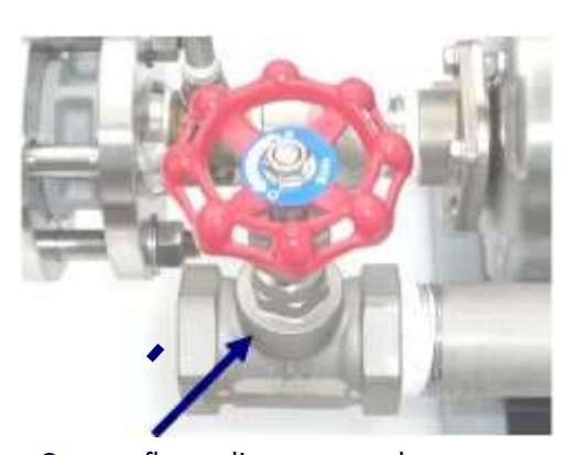
Output flow adjustment valve