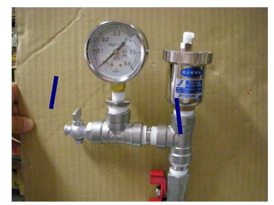
econdly pressure gauge Auto air release valve Air flow meter Air inlet valve